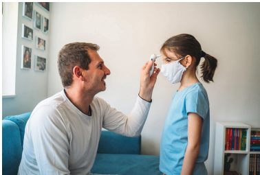
Daily Health Questionnaire

All COVID-19 and Critical District Digital Forms Included!