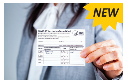
COVID-19 Proof of Vaccination & Testing Form