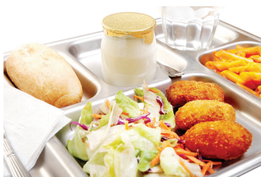
Advanced Lunch Needs Planning Form