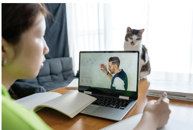
Remote Classroom Instructional Form