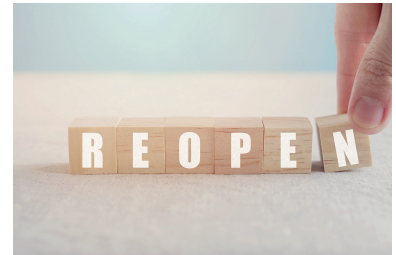
School Reopening Master Guidance Plan Form