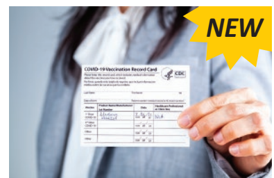
COVID-19 Proof of Vaccination & Testing Form