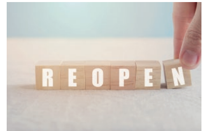
School Reopening Master Guidance Plan Form