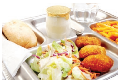
Advanced Lunch Needs Planning Form